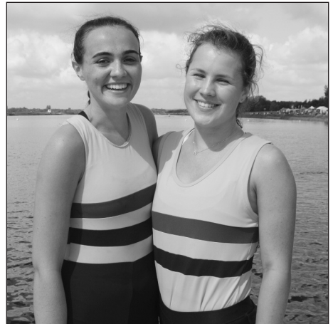
CHRISTCHURCH Junior Girls Under 16 Double Sculls