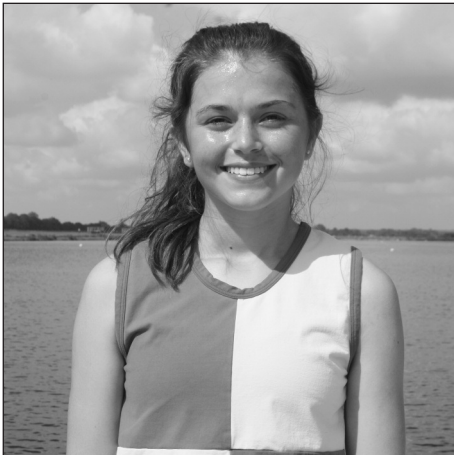
LYMINGTON Junior Girls Under 16 Coastal Single Sculls